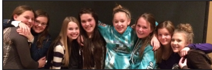
7TH GRADERS FROM NORTHWOOD MIDDLE SCHOOL ARE "MAKING A STATEMENT" AT THE SERVICE STATION!

We asked the girls the following question: